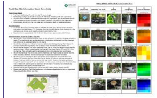
Detailed routes and games to play while hiking