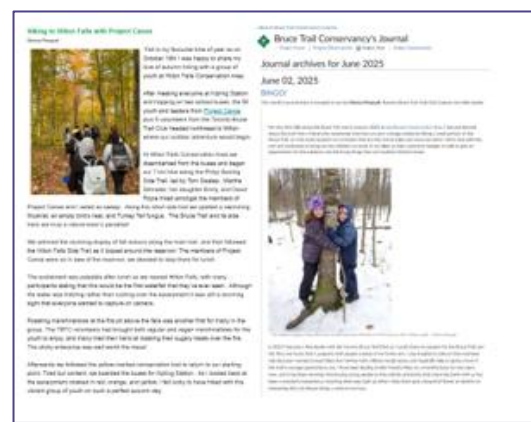
E-notes articles, iNaturalist journal posts