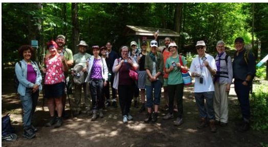
Led the first Rainbow hike in the Toronto section