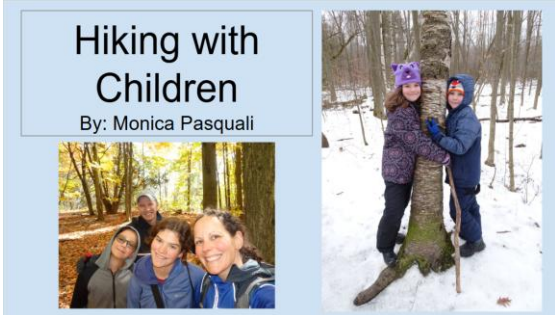
Hiking 101 presentation - tips for hiking with kids