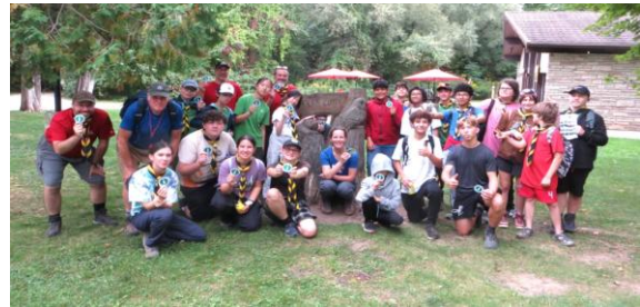
Helped organize and lead two youth bus hikes